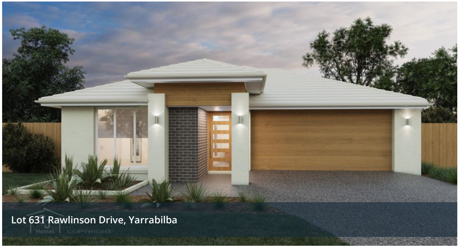
Lot 631 Rawlinson Drive, Yarrabilba